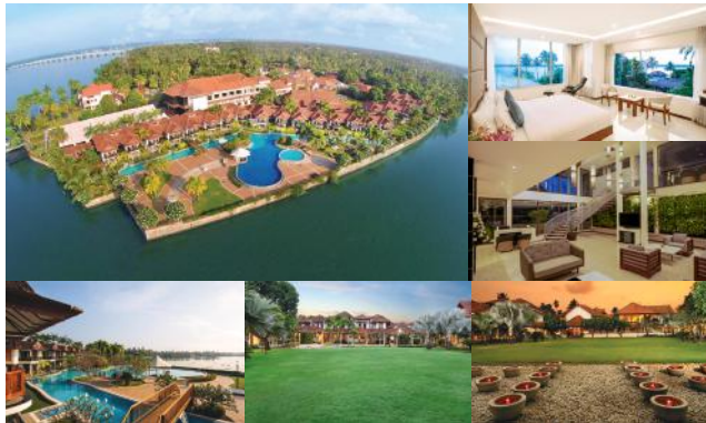
RAMADA RESORT BY WYNDHAM KOCHI, INDIA